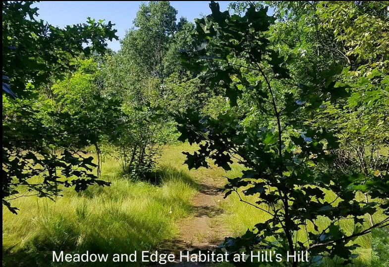
Meadow and Edge Habitat at Hill's Hill