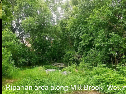
Riparian area along Mill Brook - Wellington Pk.