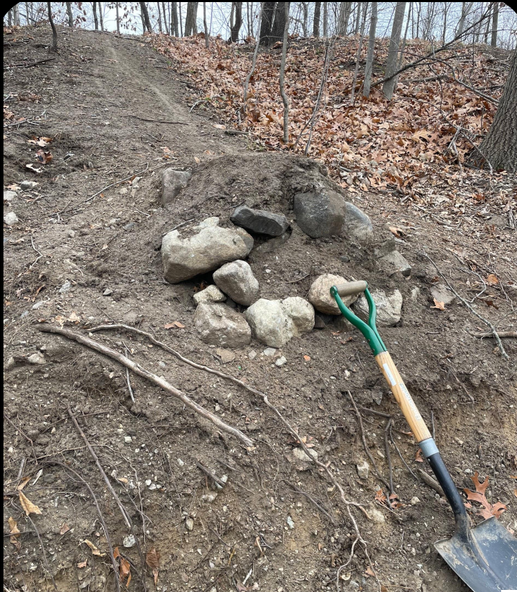
Hill's Hill Jump