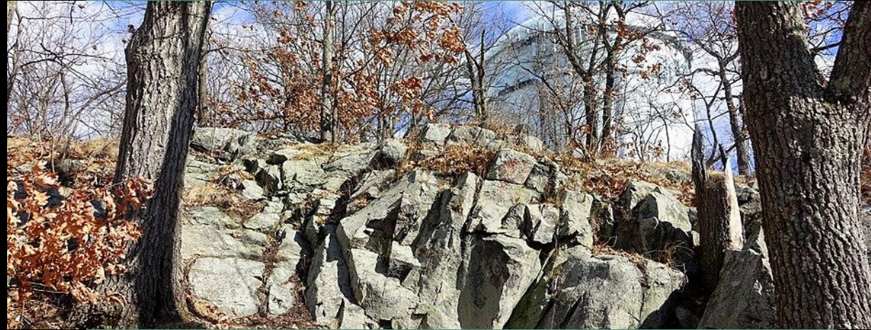
Majestic Rock Features at Turkey Hill