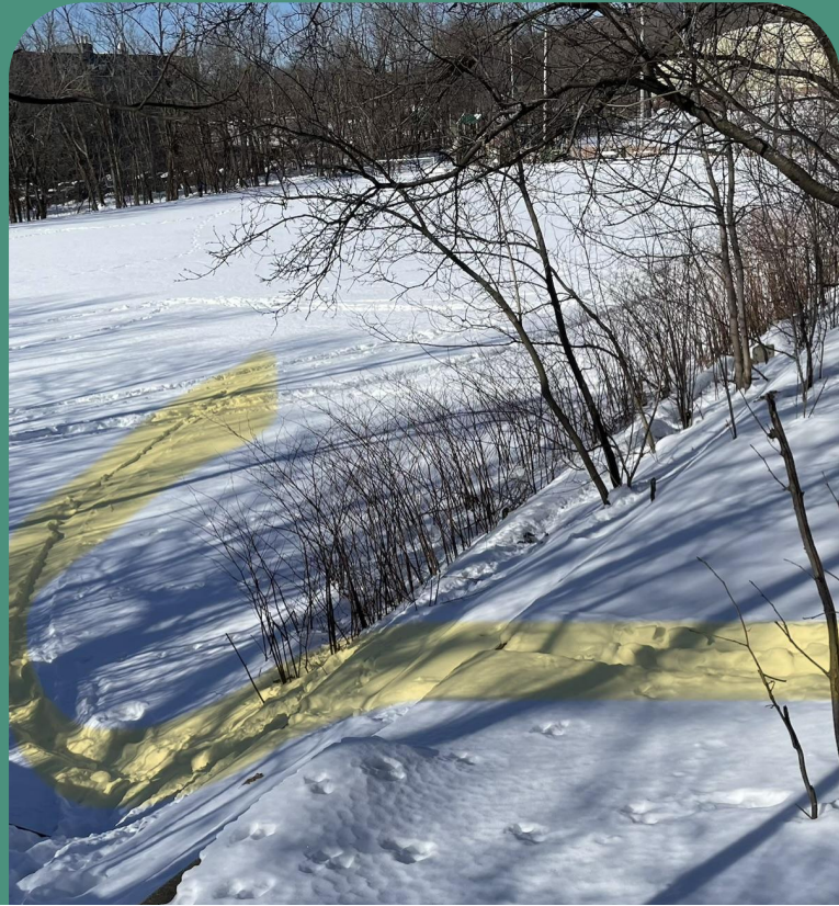
aiming at low berm & high wall