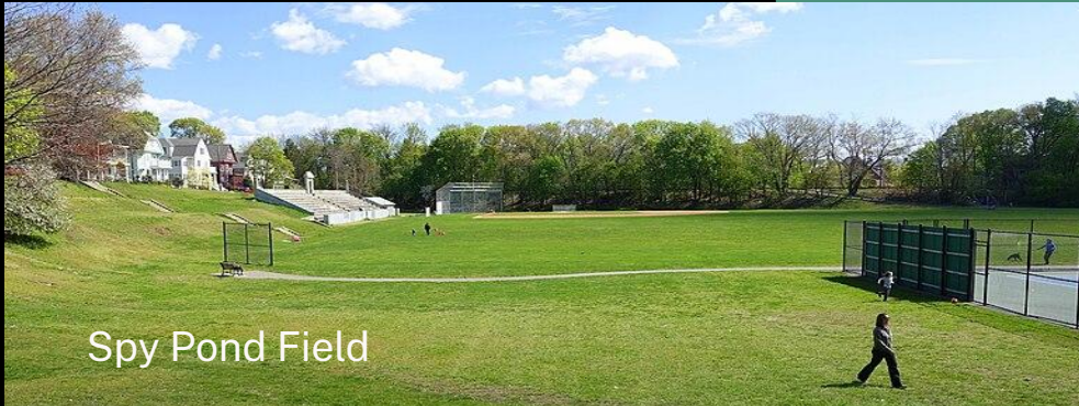
Spy Pond Field