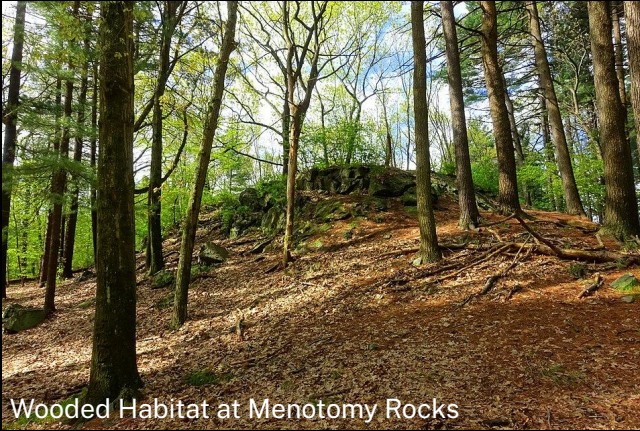
Wooded Habitat at Menotomy Rocks