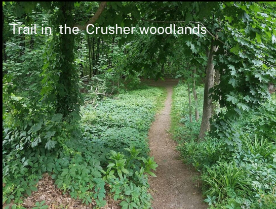
Trail in the Crusher woodlands