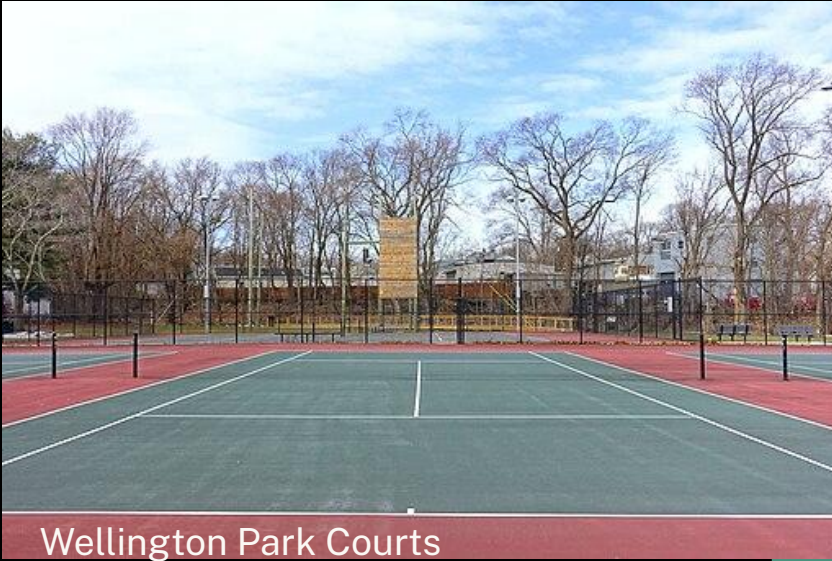
Wellington Park Courts

Expensive court, field & playground surfaces need protection